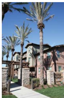
Vineyard Town Homes, Anaheim

Our work has resulted in the production or approval of more than 3,500 affordable rental homes--homes that would not have been possible without the Commission's leadership.