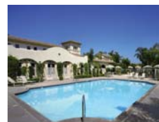
Mendocino, San Clemente